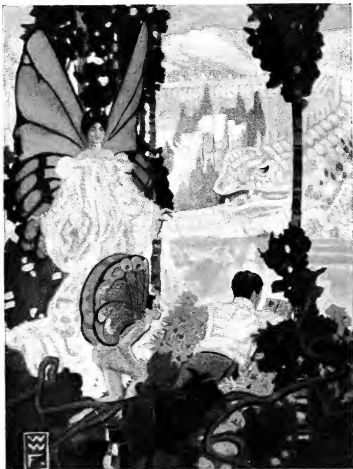
"A thousand fantasies begin to throng"